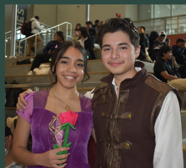
3rd Place: Rapunzel & Flynn Rider