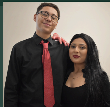
2nd Place: Morticia & Gomez Addams